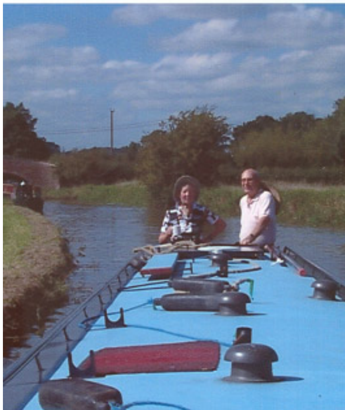
The above photo is from last summer's canal trip.